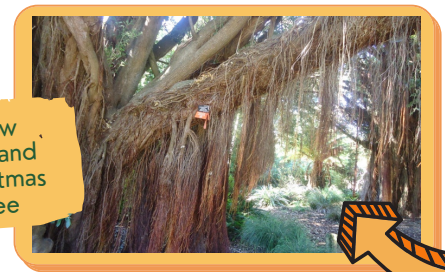
New Zealand Christmas Tree